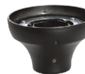
aluminium luminaire base