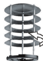
Stainless steel louvre reflector