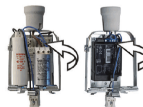
universal gear frame with electromagnetic or electronic gear