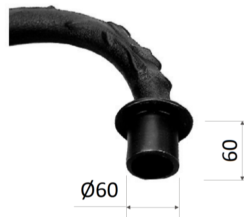
Spigot ending arm