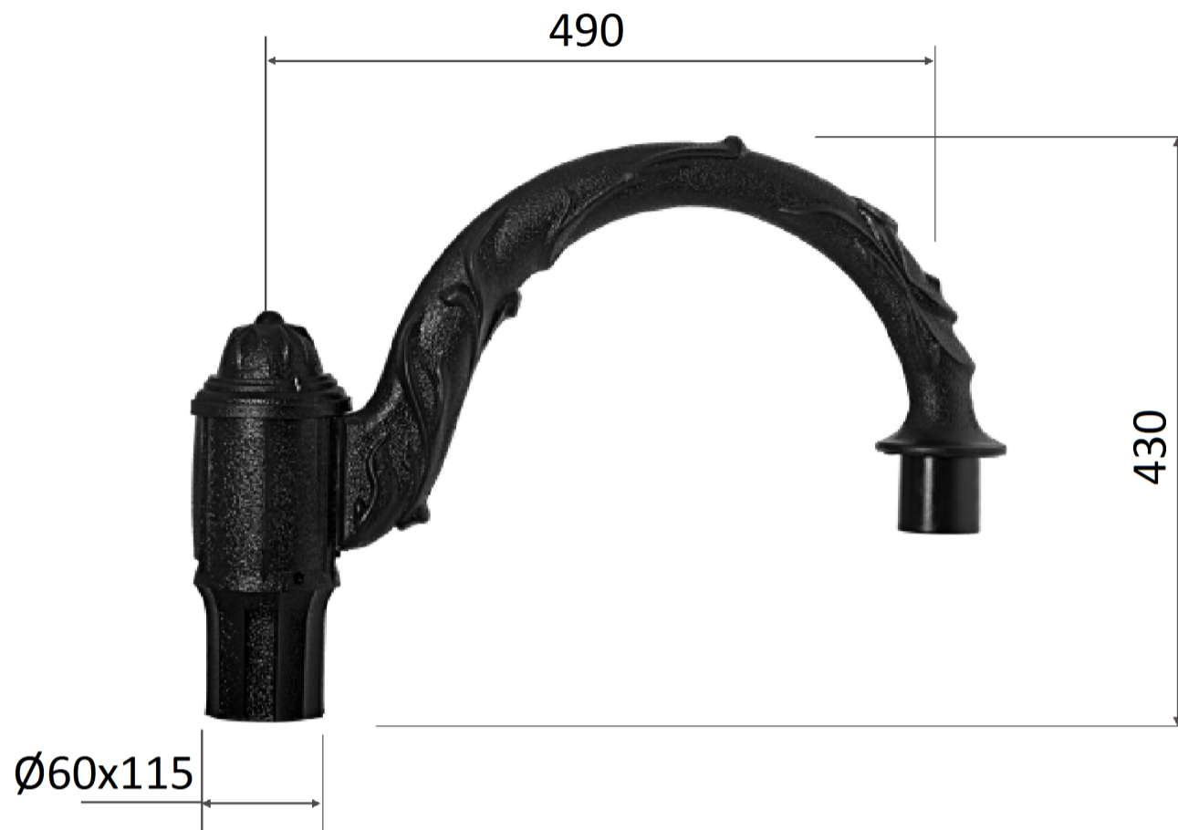
Arm system „1” downwards